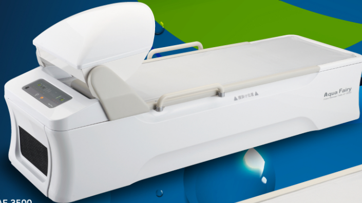
AF-3500 Option type